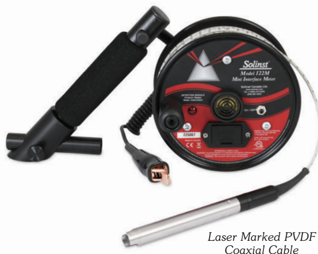
Laser Marked PVDF Coaxial Cable

Model 122 is approved for use in hazardous locations Class I, Div 1, Groups C&D based on CSA Standards and is ATEX certified under directive 94/9/EC as II 3 G Ex ic IIB T4 Gc