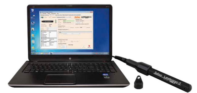
Fast communication and downloading speeds with a high speed Field Reader 5