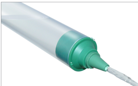
Model 428 BioBailer