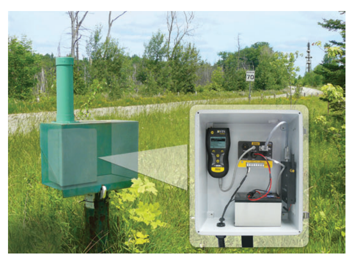
STS NEMA 4X Enclosure

STS Gold Systems come with standardized equipment configurations, including your choice of communication device to meet the needs of your application. The STS Remote Station consists of an STS Controller, Distribution Box, Battery, and Modem with a connected Antenna, protected within a weatherproof Nema 4X case.