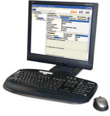
Automatically receive remote system diagnostics at your Home Station PC.

To help simplify system diagnostics, each data report to the Home Station includes System information. This information can help prevent data disruptions by providing the battery level, modem operation, signal strength and Levelogger status. A communication test can also be performed between the Home Station and a Remote Station, and Leveloggers.