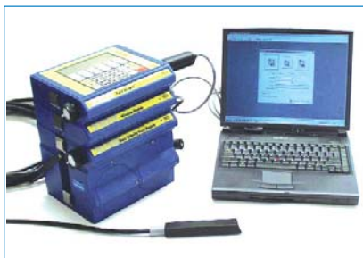
2100 Series modems are set up using Isco Flowlink® Data Management Software

* Battery life with: one 2150 Module and one 2103 Module using a 2191 battery module with two 6-volt alkalines — 15-minute data intervals, one interrogation per week.