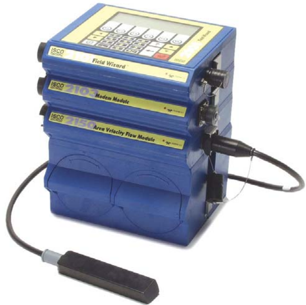
Photo above shows a typical flow module grouping that includes Isco's 2101 Field Wizard™, a 2103 Modem Module, a 2150 Area Velocity Module, and a 2191 Battery Module.

Many other variations are possible. Request a copy of our 2100 Series Flow Module Brochure for complete information.