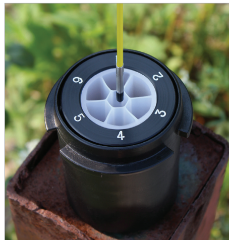
Measure water levels within the narrow channels of a Solinst CMT® System.

The 102M Mini Water Level Meter is available in 25 m and 80 ft lengths. There is the choice of the P4 or P10 Probe.