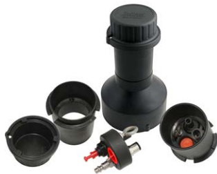
Well Caps for Dedicated Pumps

The caps slip easily onto 2" dia. (50 mm) wells. Adaptors to fit 4" dia. (100 mm) wells are also available. They have quick-connect fittings for the drive and sample tubing.