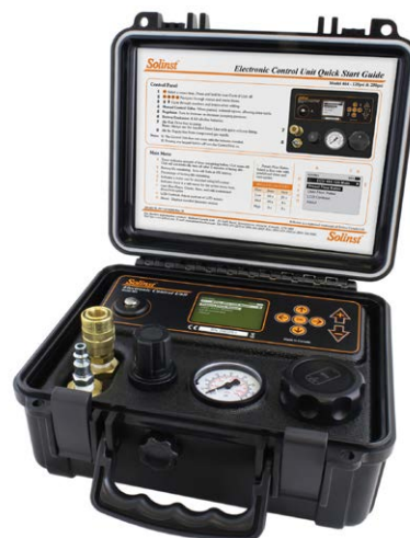
Model 464 Electronic Control Unit (125 psi and 250 psi Models)

These convenient Controllers are rugged, dependable and suitable for all environments. Quick-connect fittings allow instant attachment to dedicated well caps, portable reel units and to an air compressor or compressed gas source.