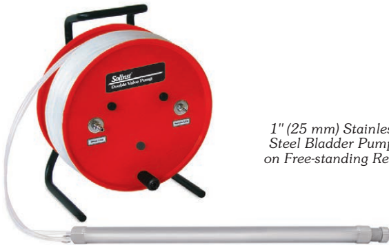
1" (25 mm) Stainless Steel Bladder Pump on Free-standing Reel

They are supplied on a free-standing reel. The rugged systems are very convenient and easy to transport. Tubing fittings on the reels and controller are compression fittings, allowing quick set up in the field. The Solinst Model 103 Tag Line can be used to lower and support the pump in the well (see Model 103 Data Sheet).