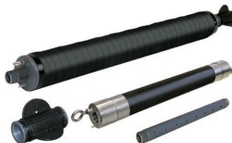
Model 800 Packers 3.9" and 1.8" (99 mm and 46 mm)

Model 800 Low-Pressure Packers can be used with Solinst Bladder Pumps to minimize purge times by reducing purge volumes. This reduces the cost of water disposal and labour. Packers are available in single point or straddle packer designs, and in sizes to fit 2" (50 mm) to 5" (127 mm) dia. wells. (See Model 800 Data Sheet.)