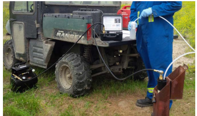
Sampling with a Dedicated Bladder Pump using Portable, Rugged, Easy-to-use, Compressor and Controller

For water level monitoring there is an access hole to fit a Solinst Model 101 Water Level Meter or Levelogger. An eyebolt is provided for a pump support cable or for suspension of a Solinst Levelogger, (see Model 3001 Data Sheet) or other device.