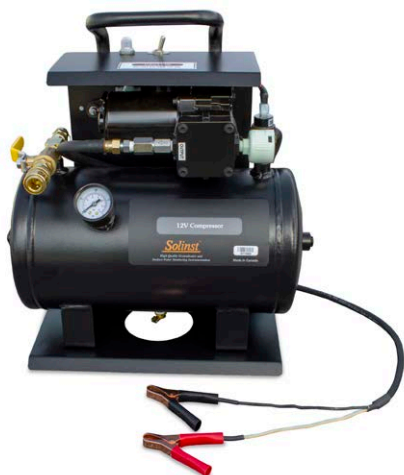
12 Volt Compressor

The compressor operates using 12 volt DC power source, such as a car or truck vehicle battery, and comes with alligator clips. The compressor operates at up to 150 psi and is equipped with a 2 US gallon (7.6 L) air tank which is rated to 175 psi.