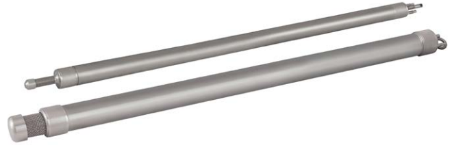
Solinst Bladder Pumps available in Stainless Steel 1" and 1.66" (25 mm and 42 mm).