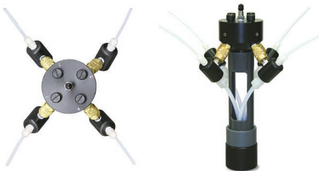
Top and Side View of Multi-Purge Manifold with 4 Pumps Connected.