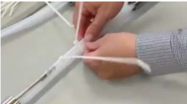
Keep tubing from twisting before adding extension.