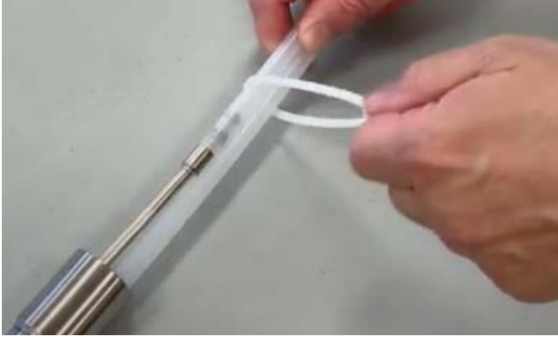
Use cable ties to bundle the tubing.