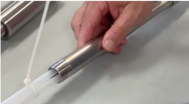
Push/move the cable tie along to keep tubing grouped and avoid twisting.