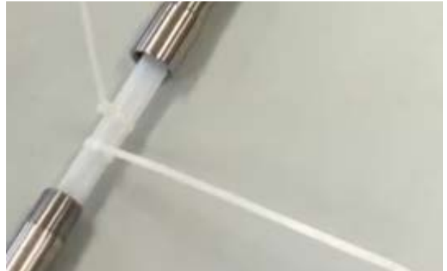
Cut and remove cable ties. Now slowly slide extension into place and tighten.