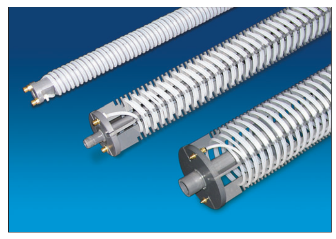
1.8", 3.8" & 5.8" Waterloo Emitters