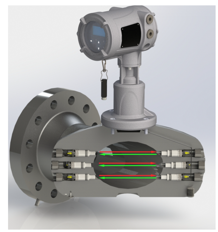
Transit time flow measurement

The LX transducer system consists of our new integrated LX transducers and our uniquely engineered buffers. The design of this system allows for the safe insertion and removal of the LX transducers at any time without isolating the flow meter, shutting down the process or using any special tools. Together with the XMT1000 electronics and LX transducer, the uniquely designed meter body provides a clean and compact flow meter system.