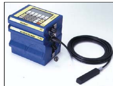
Photo above shows the Field Wizard clipped directly onto an Isco 2100 Series flow module stack. Below: The unit can also be connected to down-hole equipment using the module cable.

Note: Other options are available. Contact Isco or your authorized representative for a complete listing.