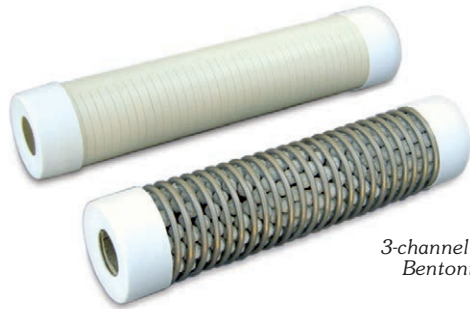
3-channel CMT Sand and Bentonite Cartridges

These cartridges are approximately 2.4" (61 mm) in diameter and will fit inside various direct push drill rods. Ideally, the borehole diameter these bentonite cartridges are used in should not exceed a nominal 3.5" (90 mm), to ensure proper expansion and sealing.