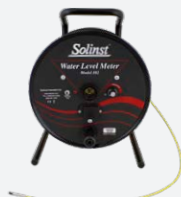
Model 102 Water Level Meter

Vapor Samples: A special Vapor Wellhead Assembly can be used to obtain depth discrete vapor samples.