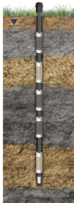
Typical 3-Channel CMT Installation in Overburden with Bentonite and Sand Cartridges

Saves Cost – through reduced permitting and drilling costs; and because narrow tubes allow smaller purge volumes, reduced disposal costs, efficient low flow sampling and rapid response to pressure changes, all reduce field time.