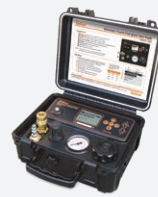
Model 464 Electronic Control Unit