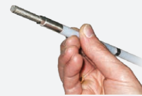
Model 408M DVP 3/8" (9.5 mm)