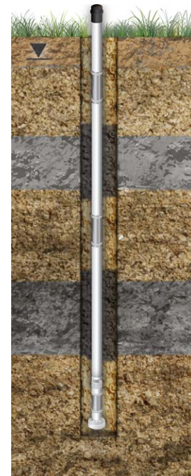
Typical 3 or 7-Channel CMT Installation in Overburden using Layers of Bentonite and Sand Backfilled from Surface