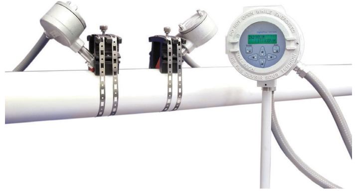
DigitalFlow XMT868i shown with clamp-on transducers

To minimize the effects of flow profile distortions, flow swirl and cross flow, and for maximum accuracy, you can install the two sets of transducers on the same pipe.