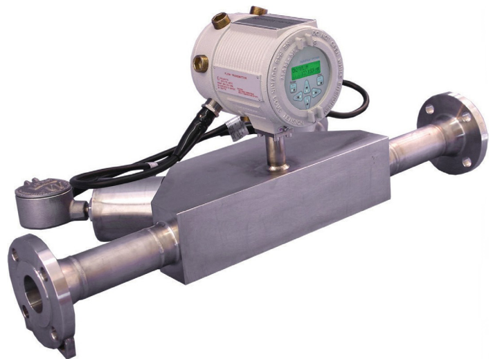
RH-Plus MR2350 dimensions

The DigitalFlow XMT868i can be used with a variety of wetted solutions including the PanaFlow™ system. The PanaFlow meter system relies on the XMT868i as an integral component to simplify installation. A DigitalFlow XMT868i is easily mounted to the top of a PanaFlow system and is shipped ready to install.