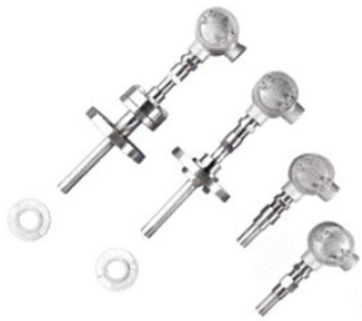
Bundle Waveguide Technology System

Even though most ultrasonic manufacturers' flowmeters can only handle up to 500°F (260°C), Panametrics BWT systems have been able to reach up to 1000°F (537°C). The unique design removes the piezoelectric element from the extreme temperatures by using wave guide technology. The transducer can even be swapped out under operating conditions. One customer has installed 16 units, replacing their wedge meters, and has had them operating maintenance free for more than five years.